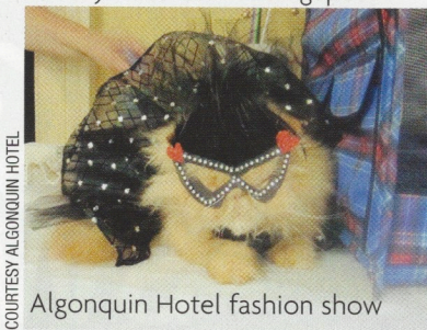
Algonquin Hotel fashion show