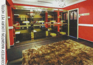
Luxury Pet Hotel — Singapore

Save the date! The world's most famous annual feline fashion extravaganza is held at the cat-friendly Algonquin Hotel in New York on either the first or second Wednesday in August. This year's date is August 10. Resident cat Matilda "hosts" this annual charity bash to raise funds for the Mayor's Alliance for NYC's Animals. People fly from all over the world to attend this famous fashion event when cats in outrageous costumes take to the catwalk. This year's theme will celebrate fashions worn by the hotel's celebrity guests, such as Jackie Kennedy Onassis and Audrey Hepburn, through the decades dating back to the hotel's opening in 1902. 59 W. 44th Street, New York, NY, 10036; algonquinhotel.com .