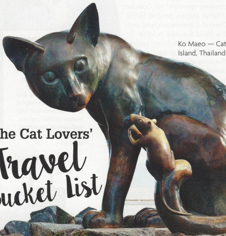
Ko Maeo — Cat Island, Thailand