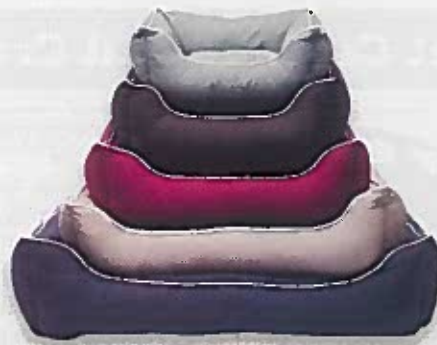
Dog Gone Smart Classic Lounger

Unfortunately, most of these high-tech products don't work when the power to your home goes out or the battery dies. Although most such products have a warning system, such as a flashing light, that reminds pet owners of when to change the product's batteries,