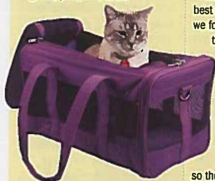
Sherpa Original Deluxe

[M] Sherpa Original Deluxe MSRP: $63-$84; Best Price: $50