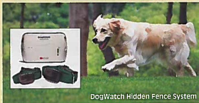
DogWatch Hidden Fence System

>> You'd have to spend at least an additional $353 to get another underground pet-containment system that has a lifetime warranty, as the PCC-200 Plus does. This model's combination of a progressive-correction feature, a base 5-acre