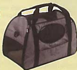
Gen7Pets Carry-Me Pet Carrier

repeat Best Buy selection, delivers exceptional value for a soft-shell pet carrier. No other pet carrier that's in this price range can match this model's variety of sizes. We also like this model's top and side openings, ventilation on three sides and Sherpa's Guaranteed-On-Board program, which guarantees full reimbursement for the cost of your airline ticket if you're denied boarding because of the pet carrier.