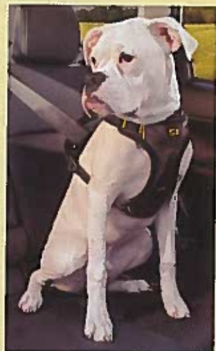
Kurgo Impact Dog Harness

» The Enhanced Strength Tru-Fit Smart is a repeat Best Buy selection because of its combination of safety features. This is the only seat belt that we found in this price range that the company says was crash-tested by using a simulated 75-pound dog. We also like this model's all-steel nesting buck-