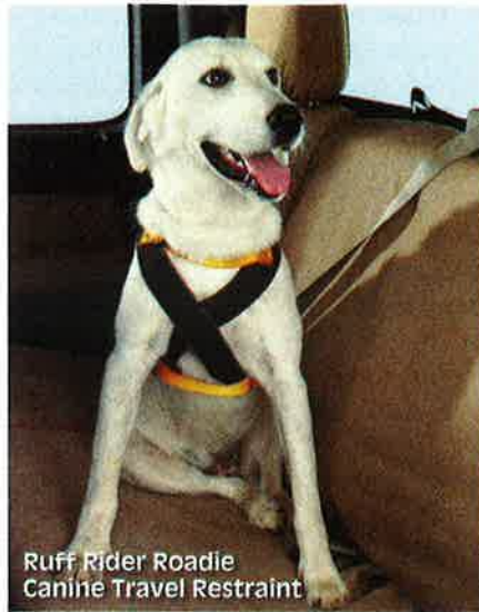
Ruff Rider Roadie Canine Travel Restraint