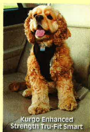
Kurgo Enhanced Strength Tru-Fit Smart

>> The solid design and construction of the easy-to-adjust Enhanced Strength Tru-Fit Smart harness includes all-steel nesting buckles and five adjustment points. A broad, padded chest