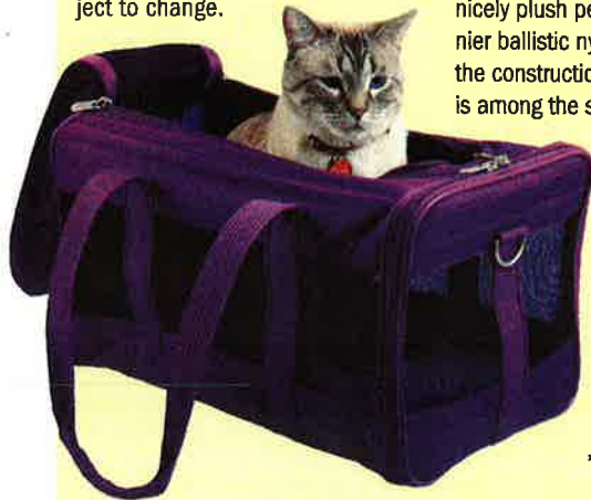
Sherpa Original Deluxe

Best Price is a reflection of the lowest retail price that was available at press time for the smallest version of the model and is subject to change.